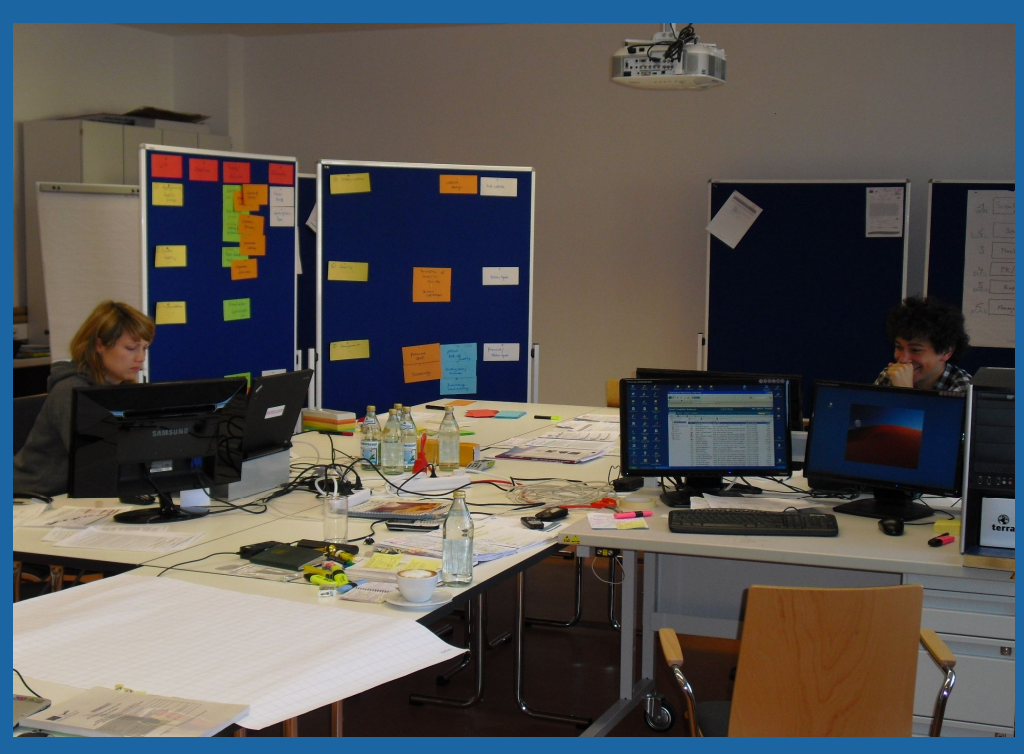
ELL-SAT APPLICATION WORKSHOP SEIDEL, RAMIREZ in Freyung – Bavaria February 2011