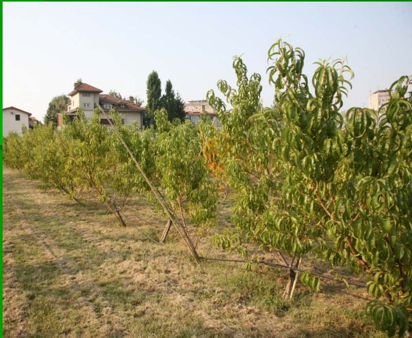
V planting system

Comparison of the effect of different planting systems and organo-mineral fertilizers on the behaviour of some new peach tree varieties under the conditions of the Romanian Plain.